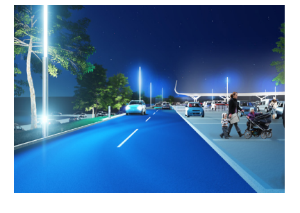
The blue "loop"