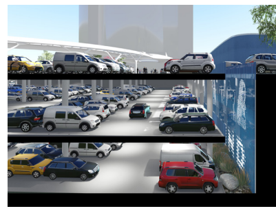
Experience throughout the parking