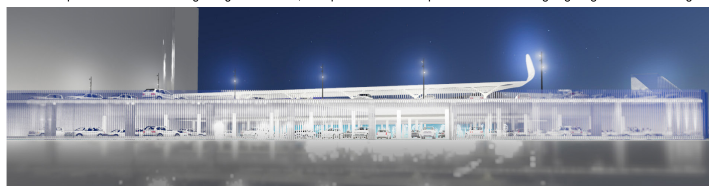
Interplay between facade, canopy, lighting and parking